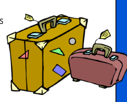
For safety reasons, campers are NOT allowed to have cell phones or electronic devices at camp. No wifi is available. No knives or hunting equipment allowed.

Clothing should be casual, comfortable, modest and suitable for various weather conditions and hiking. No bikinis, halter tops, spaghetti straps, etc. Camp reserves the right to determine what is modest apparel. Coin operated laundry facilities are available for camper use. Horseback riding and some ropes course activities require long pants & tie shoes.